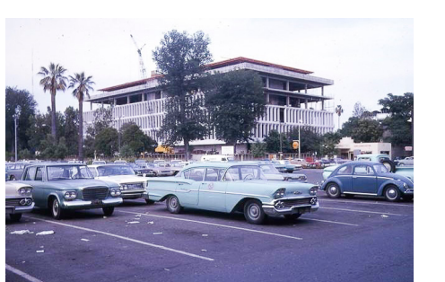
Construction of the Gordon D. Schaber Courthouse, circa 1963

justice. This building will reflect this pride and serve as a reminder that the work we do is not only important, but must be approached with care and sensitivity," said Seale. "The new courthouse will