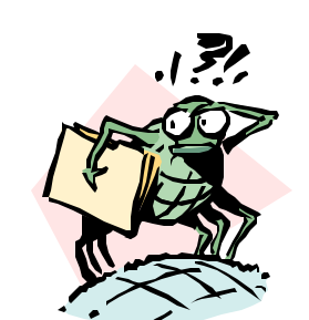
Don't confound your chances for reciprocal benefits!