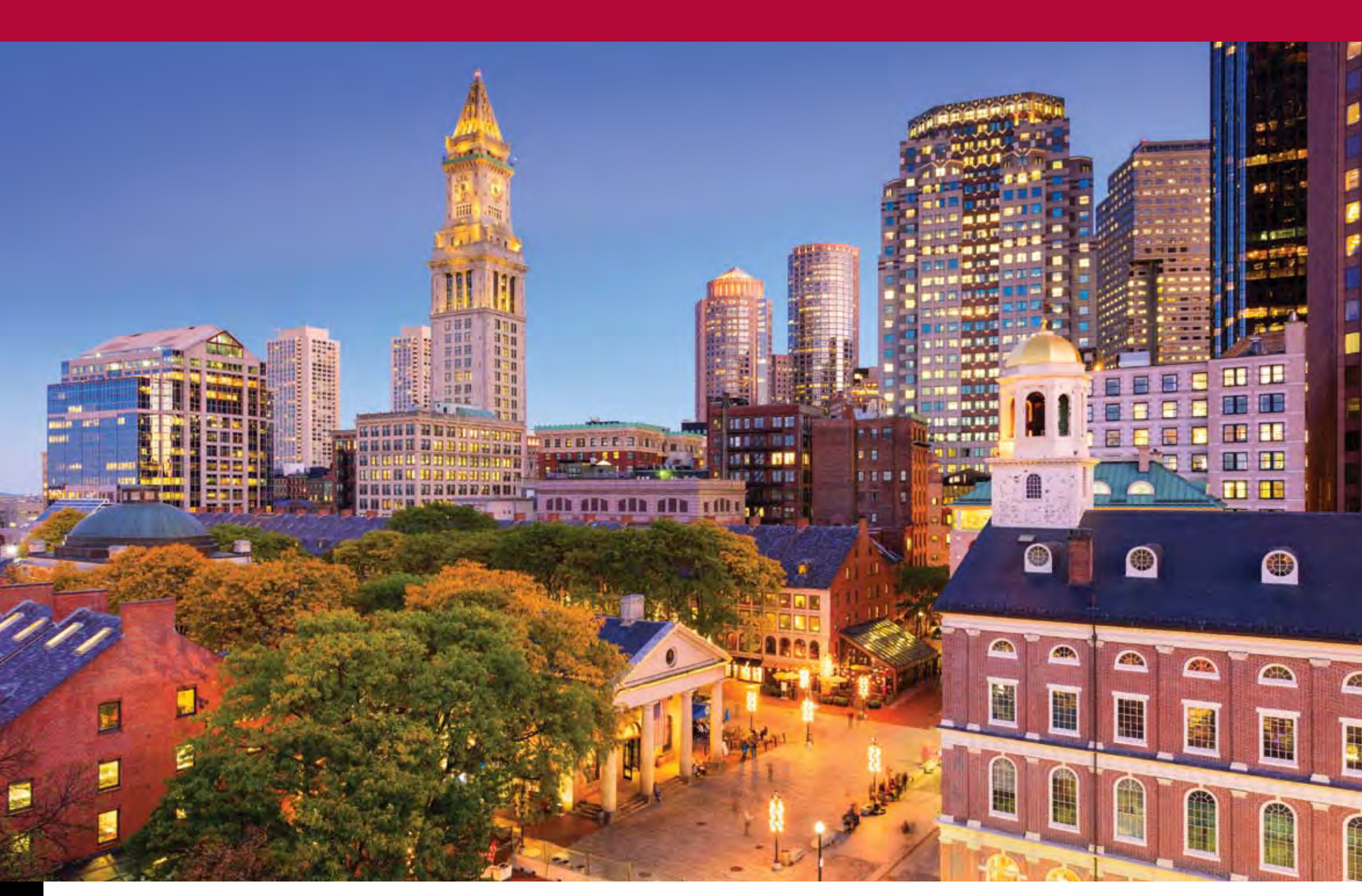
The InterContinental Hotel Boston, October 23<sup>rd</sup> to October 25<sup>th</sup> 2017 • Go to www.global-arc.net for the latest program.